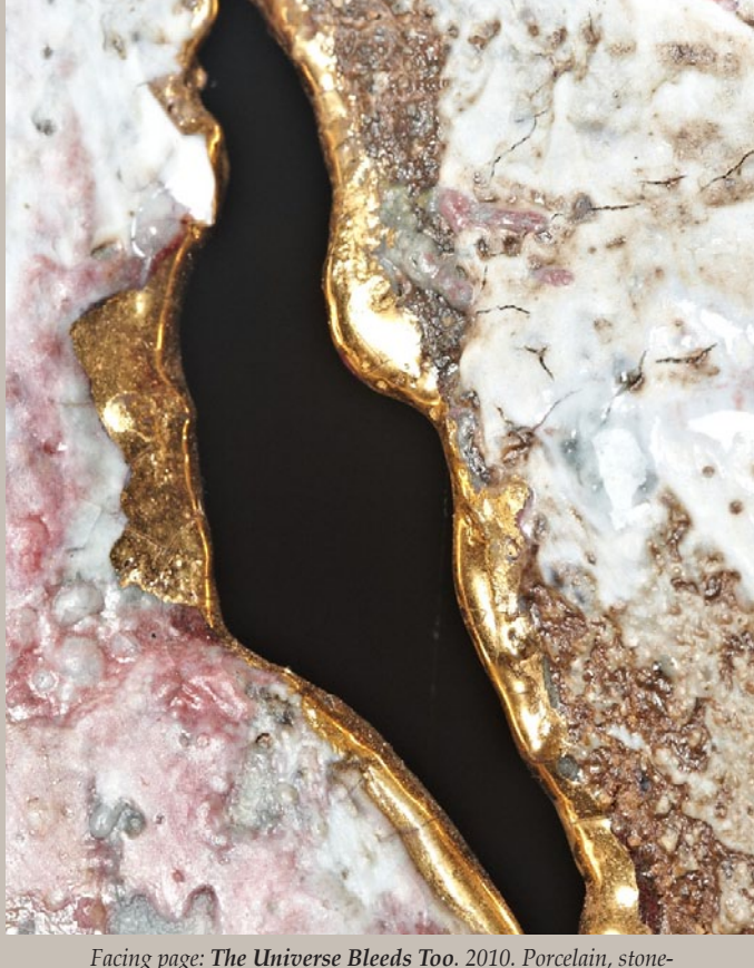
Facing page: The Universe Bleeds Too . 2010. Porcelain, stoneware, sang de boeuf and firebrick inclusion. 21 x 19.3 x 18 in. Above left and right: The Universe Bleeds Too (Details) . Below: Bronze is Not All . 2011. Porcelain, satin glaze, feldspathic glaze, iron, porcelain slip, platinum and Mother of Pearl lustre. 15.5 x 9 in.

ceramics is they are quite abstract, yet each has a strong, individualist personality, and many allude to traditional ceramic vessel forms. They seem to have past, present and future lives – to be alive. There are four images of The Universe Bleeds, Too. I see a squat pot about 21 x 19.25 x 18 inches, with its swollen white mouth, dark images at the base and gray, white and red sides. Something compelling is going on inside and outside. The bullet-like hole with a drip of red glaze running out of it may be melodramatic and so is the gold-seamed larger opening on the other side. Mason's words, written on the page with the vase (not on the vase): "Our desire to touch and caress lies closely to our fear to be burned."