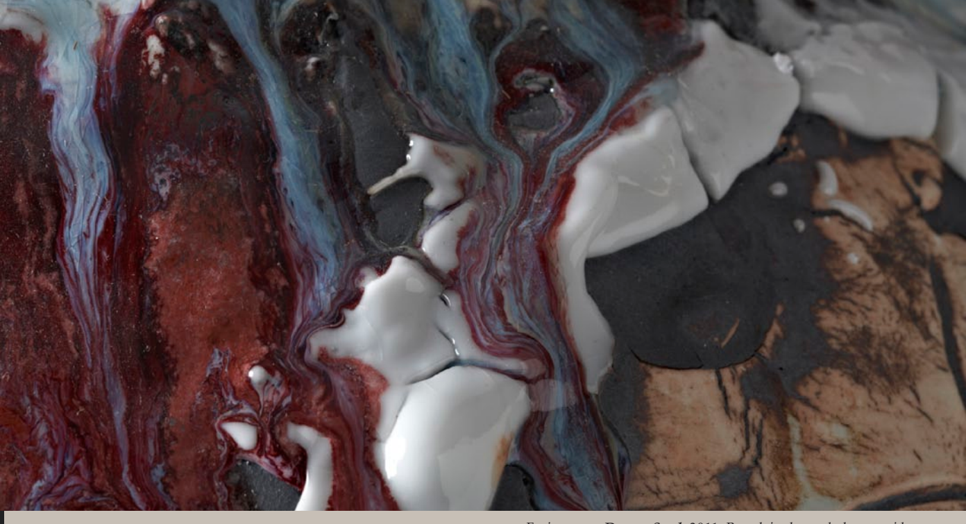
Facing page: Dream Seed . 2011. Porcelain, layered glazes, oxides, feldspars and lustre. 20 x 19 x 29 in. Above: Dream Seed (Detail) .